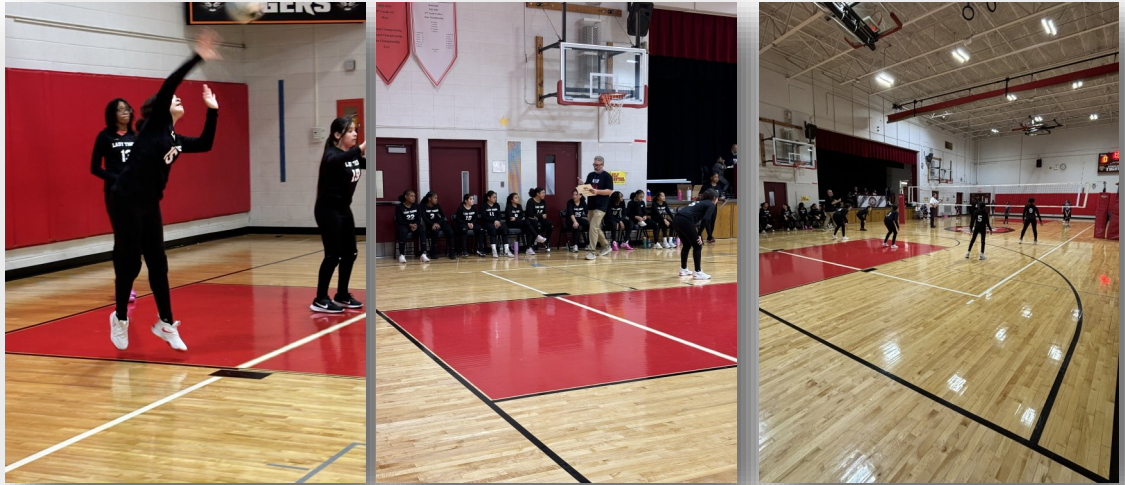
Volleyball season for Coolidge Middle School Lady Tigers has begun. The schedule is available at Coolidge.